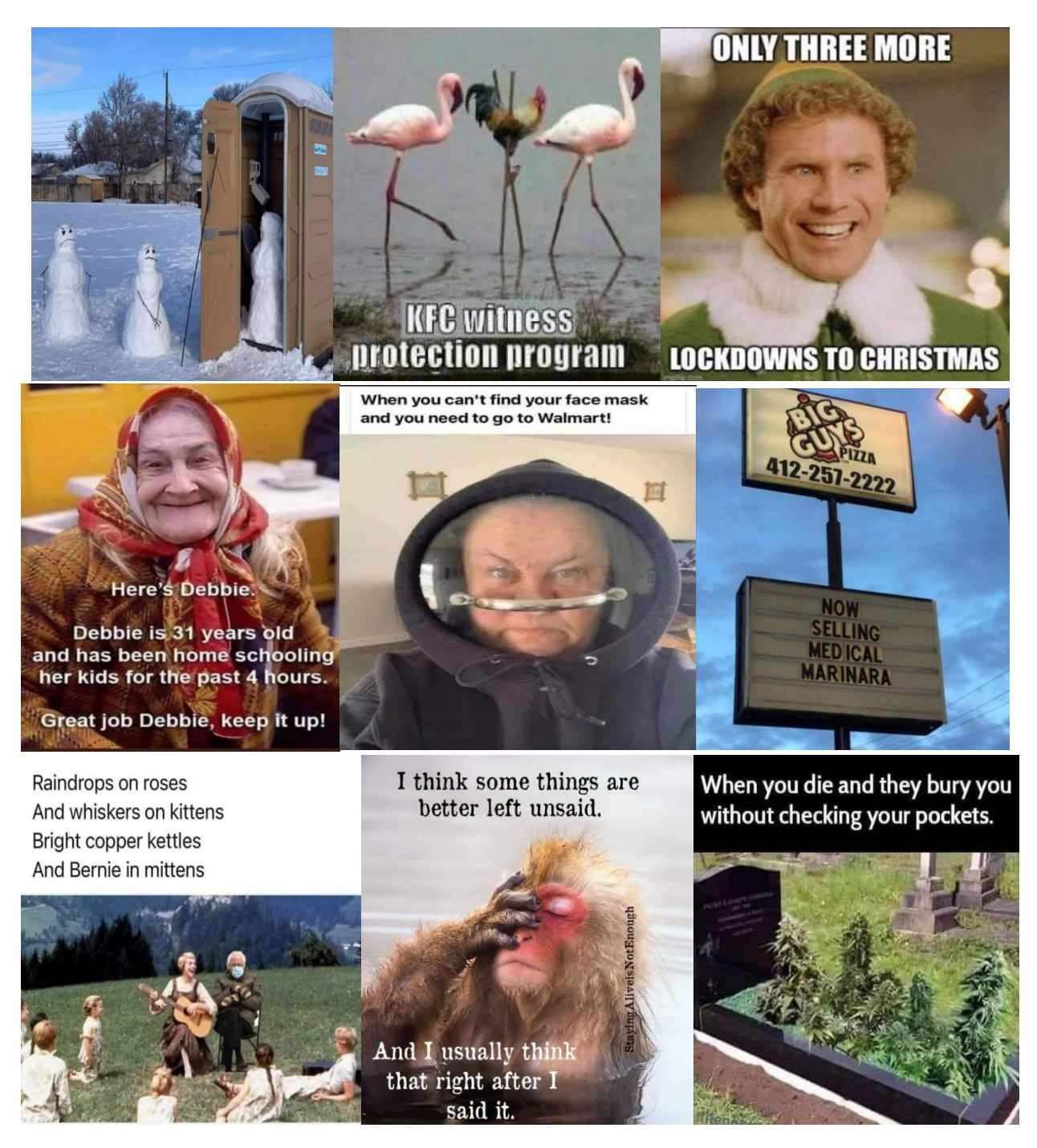
Look at who made a cameo Appearance