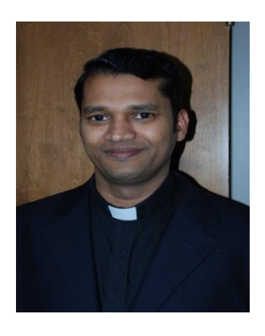
Dear Brother Knights,